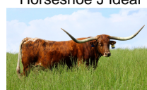
Horseshoe J Ideal