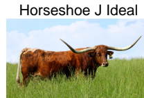
Horseshoe J Ideal