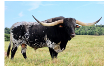
HL Double Barrel