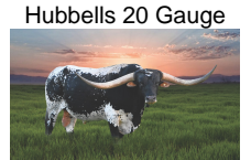
Hubbells 20 Gauge