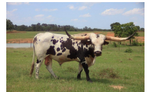
RIO BRAVO CHEX