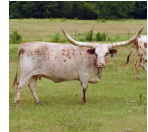
BL WORKING SIS