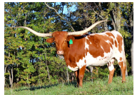
HUNT'S RESPECTED DIANNE