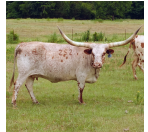
BL WORKING SIS