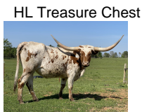
HL Treasure Chest