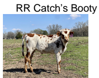
RR Catch's Booty