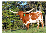
HUNT'S RESPECTED DIANNE