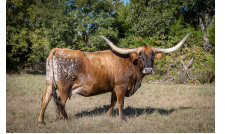
HORSESHOE J INNOVATE