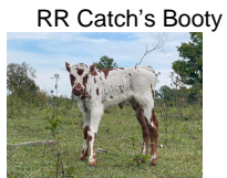
RR Catch's Booty