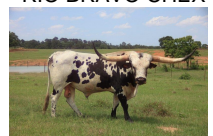
RIO BRAVO CHEX