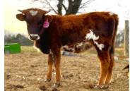
RR Catch's Lady